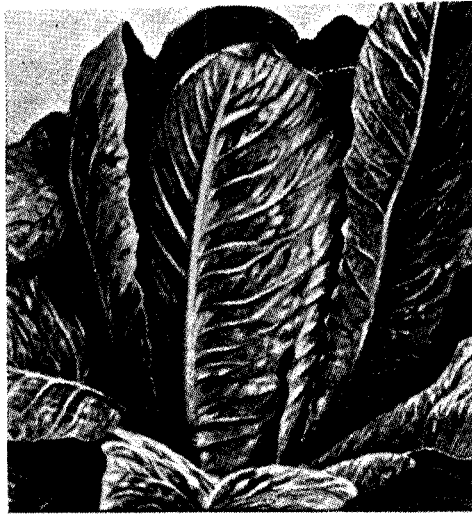
ENGLISH LETTUCE חזרת

It is meritorious to use this for maror on Passover, as in Shulchan Aruch Orach Chaim 473:5, and in Responsa Chacham Tzvi 119. Chasham Sofer (Orach Chaim 132), states as follows: Indeed, lettuce is the choice species to use for maror , and my mentors o.b.m. used it. We, likewise, follow in their path. But I am accustomed to preach on Shabbos Hagadol that one who has no reliable, G-d-fearing people to examine it and cleanse it of the small insects that are prevalent during the Pesach season and are not visible to people with weak eyesight, should not take lettuce, even though it is the first choice, lest he stumble upon a negative commandment or many such commandments. Even when there is just a possibility of transgressing these commandments, one may not take this risk in order to fulfill a Rabbinic enactment, for such is the nature of the mitzvah of eating maror after the destruction of the Temple. Let him, instead, use horseradish.