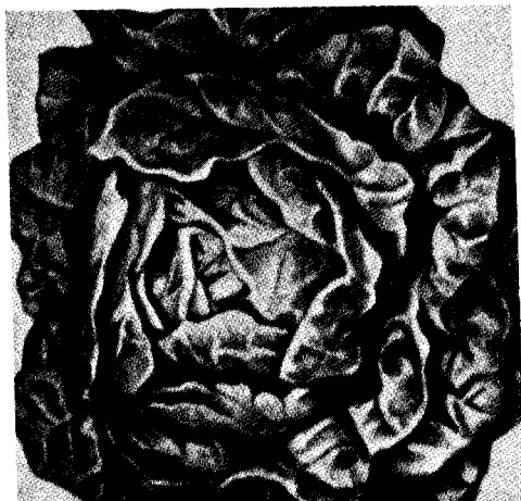
FRENCH LETTUCE חזרת

We will proceed to the matter of examining lettuce. In the mishnah ( Pesachim 39a) are enumerated the various species of herbs that may be used for maror . The first of these is chazeres . The Gemara defines this as chassa . Lettuce is called chassa until this day in Eretz Israel. In Arabic too, lettuce is known as chassah .